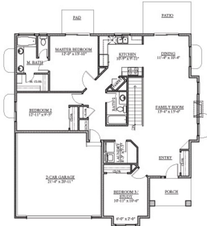
MAIN LEVEL FLOOR PLAN - 1516 Sq. Ft.