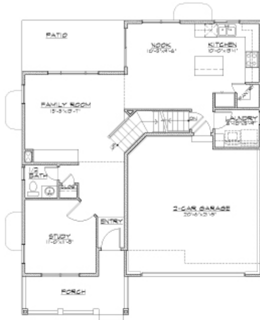
MAIN LEVEL FLOOR PLAN 922 Sq Ft