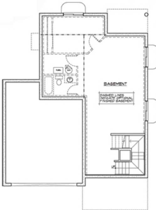
BASEMENT FLOOR PLAN 849 Sq Ft

In a continuing effort to improve our homes, Von's 31, llc reserves the right to make changes and/or modifications to plans, elevations, specifications, features, colors, and prices without prior notice. Optional upgrades may be shown for illustration purposes.